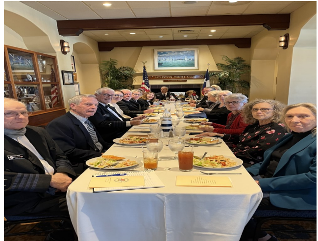
Happy members and guests enjoy a great meal at Houston Yacht Club.